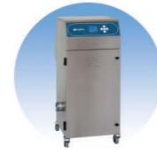
Fume Extraction System