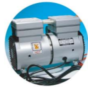
Air Compressor Unit