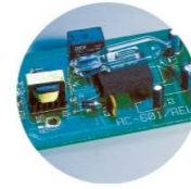
SmartGUARD™ Fire Alarm (Patented)