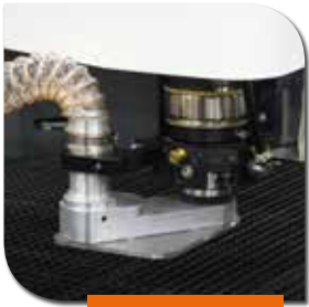
Suction inlet on the cutting head