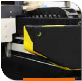
Safety optic barriers