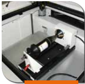
360° rotary attachment