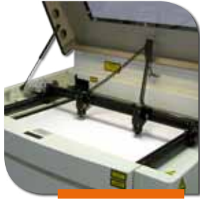
Additional cutting head for dual work process