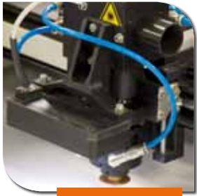
CCD kit for register cutting with print marker recognition