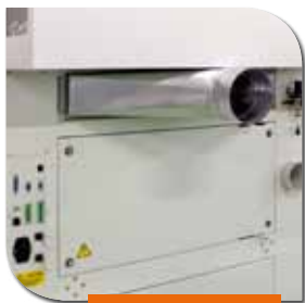
Additional flange for suction