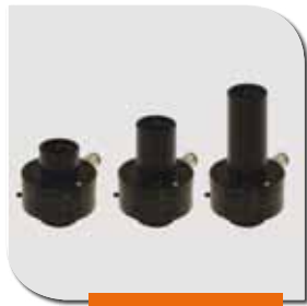
Focal unit set : interchangeable optics and focal units